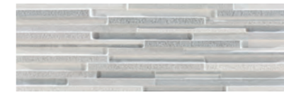
Ess. Denali Silver