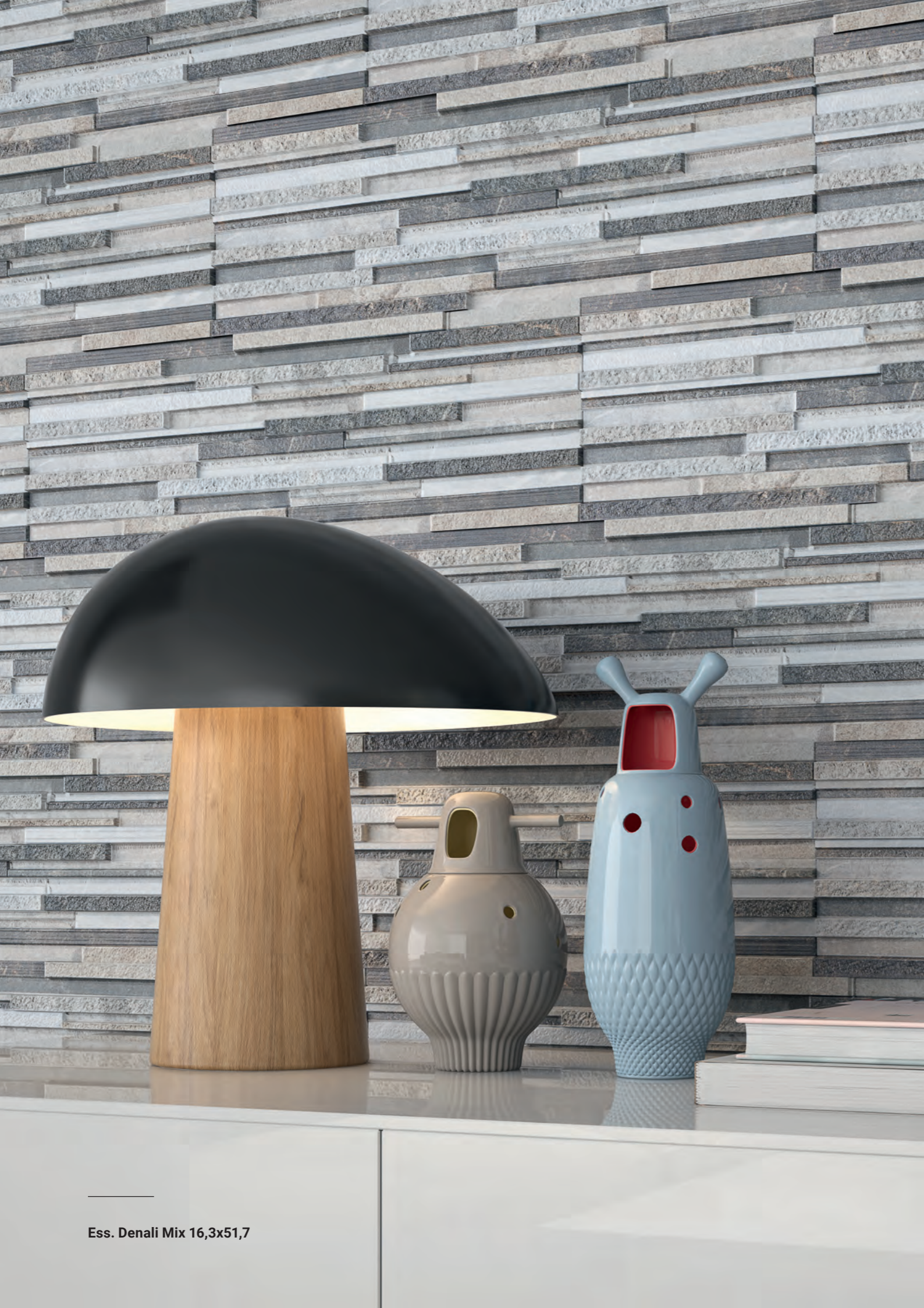
Ess. Denali Mix 16,3x51,7