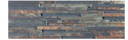
Ess. Denali Magma