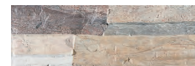
Ess. Shasta Terra