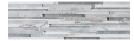
Ess. Denali Gris