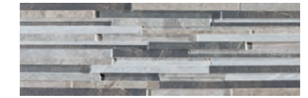
Ess. Denali Mix