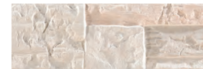
Ess. Shasta Arena