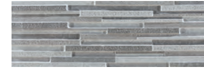
Ess. Denali Antracita