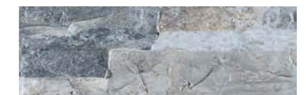
Ess. Shasta Grafito