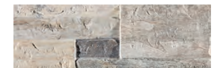
Ess. Shasta Ocre